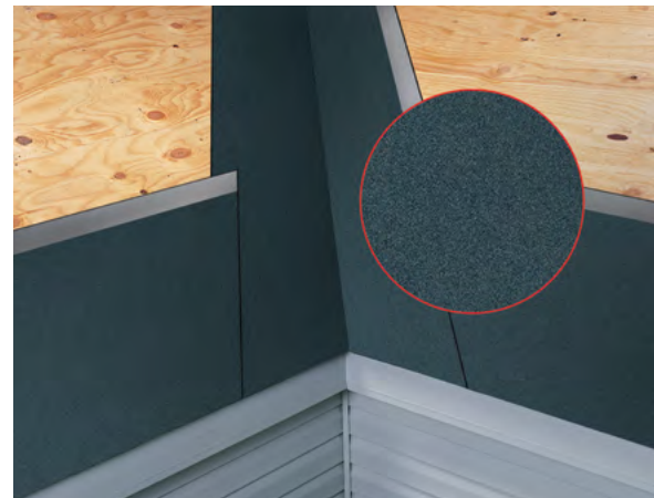
WeatherLock® G Granulated Self-Sealing Ice & Water Barrier